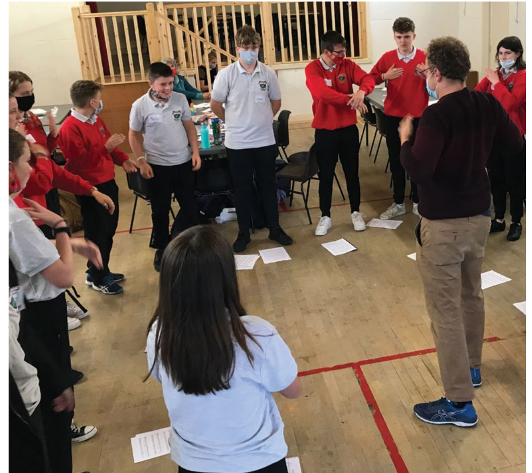
Workshops at Coláiste Naomh Eoin on Inis Meáin brought the participants together with a team of creative professionals to get to work on the opera.

Each group can create art without the other, although for several reasons the non-professionals will find it harder to fulfil their potential. Co-creation happens when they work together, and the result is greater than the sum of the parts because it is art that neither could have made alone. The interaction of professional and non-professional artists challenges everyone, sparks new ideas and insights, and generates novel forms and alternative meanings. It destabilises assumptions, producing creative energy that makes art unknown, risky and vital. Co-creation is a thrilling, joyous process that, once experienced, is never forgotten.