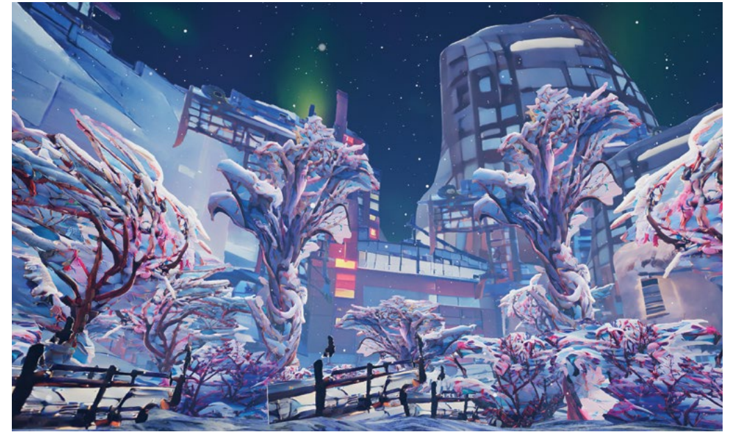
One of the background visuals from the Virtual Reality opera.

New technology can be hard to understand. It took decades for painters to adapt to the invention of photography. Arguably, they are still. It took almost as long for photographers to understand the language and grammar of their new art. Making phone calls may be one of the less important uses of the smartphone, but it was certainly the one its inventors were focused on. So it is understandable if opera—for whom the unmediated voice is an almost sacred ideal—is still searching for ways to accommodate the digital revolution in information and communication technology.