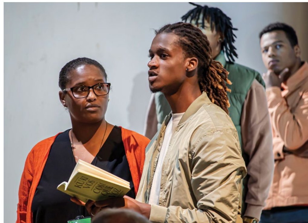
In Leiria youth prison, inmates performed with their relatives at key points in the opera.

Although new works are sometimes commissioned, community opera usually involves non-professionals in the performance of a repertoire piece, planned and led by professional artists. There are good reasons for this. Singing Mozart or Puccini is exceedingly difficult. Inviting someone who does not have the vocal resources or experience to do it in public is likely to set them up to fail. So community opera generally has amateurs singing chorally and professional singers in the leading roles—a practice that is common in performances of Handel's Messiah . Community opera can produce wonderful experiences for audiences and performers alike, but it also risks reinforcing the very social norms it seeks to overturn. The professional artists are the centre of attention, the characters who matter, while the non-professionals become a group without agency or even much individuality.