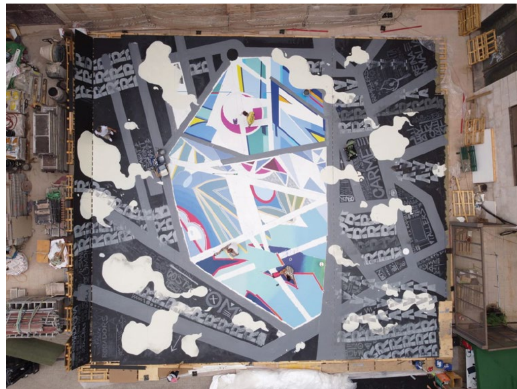
The stage floor of La Gata Perduda was based on a map of Raval, painted outdoors in the neighbourhood by local artists and students.

Listening is an underestimated skill, perhaps because it is not so easy to develop. It requires care and concentration, paying attention to what may be hinted at or not said at all. It means being aware of our own assumptions and how we might be (mis-) interpreting what we hear. It means checking in with the other by telling them that what you think you have heard. It also involves listening to what you say, and how that might be interpreted: does it sound like more of a promise or a commitment than you intended?