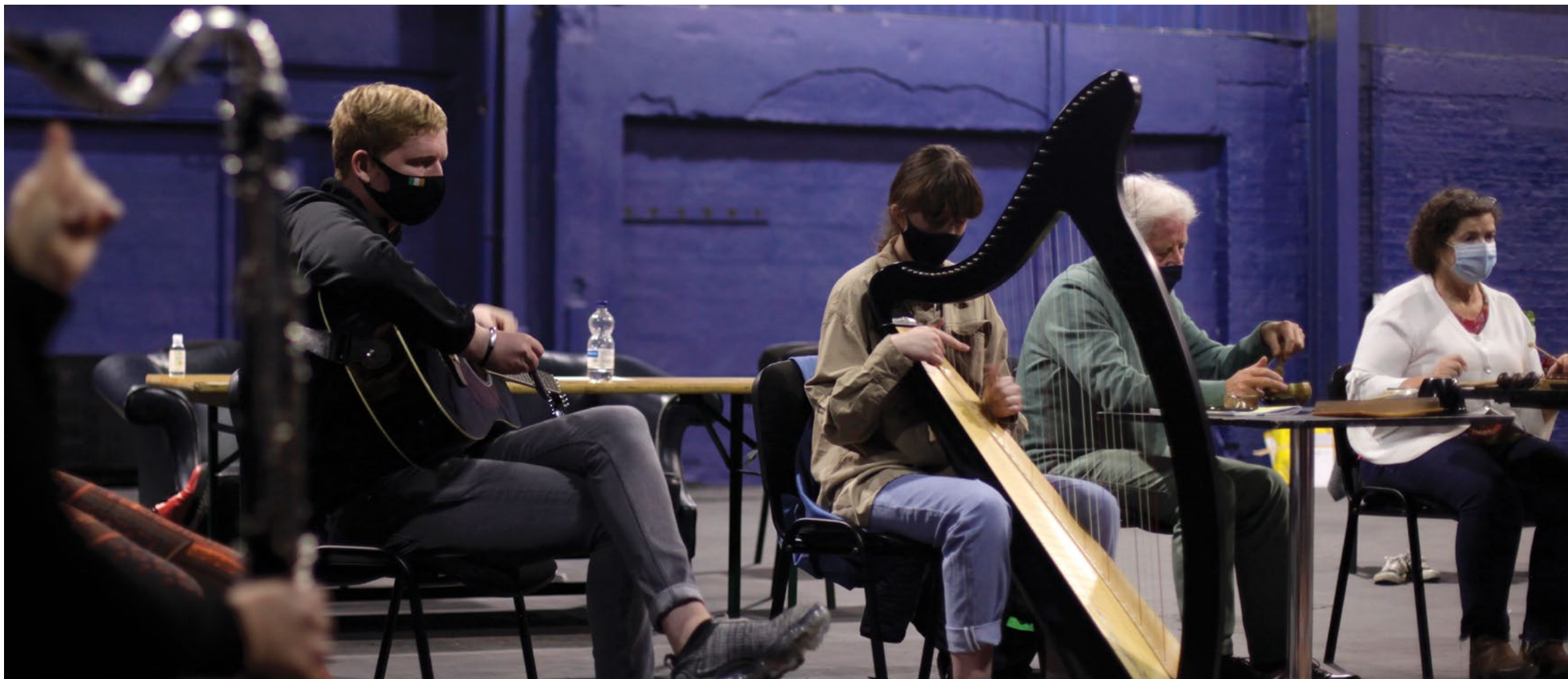
Dublin workshop with teenagers from rural Ireland and adults from Tallaght.